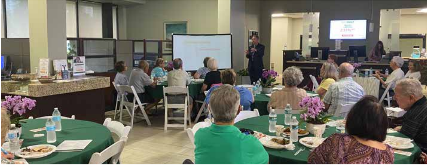
FBI Lunch & Learn