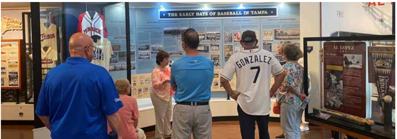
Ybor City & Tampa Baseball Museum