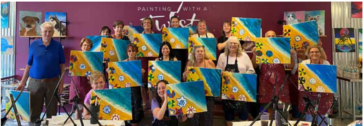
Painting with a Twist