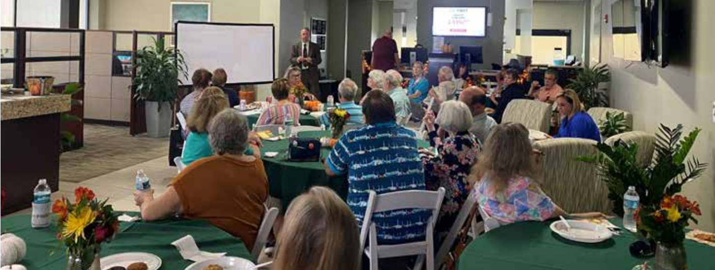
FBI Lunch & Learn